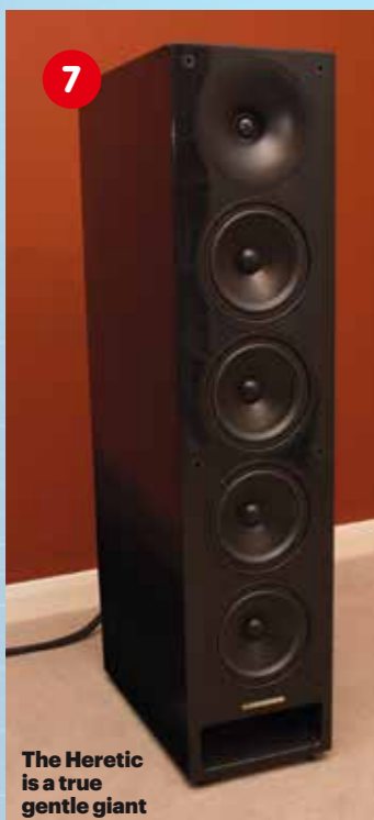
The Heretic is a true gentle giant