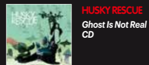
HUSKY RESCUE Ghost Is Not Real CD