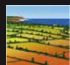
LEMON JELLY Lost Horizons Vinyl