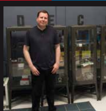
Kempson Close Aylesbury, Buckinghamshire HP19 8UQ Tel: 01296 422224 decoaudio.com

audionote.co.uk box-designs.com talkelectronics.com atlascables.com silvercore.de croftacoustics.co.uk ortofon.com heliusdesigns.co.uk proac-loudspeakers.com nottinghamanaloguestudio.co.uk audion.co.uk/products.html hereticaudio.com avantgarde-acoustic.de/en cec-web.co.jp/english_index.html airaudio.co.uk/brands/hana